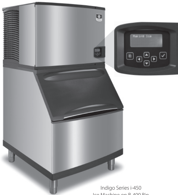
Indigo Series i-450 Ice Machine on B-400 Bin

Designed for operators who know that ice is critical to their business, the Indigo™ Series ice machine's preventative diagnostics continually monitor itself for reliable ice production. Improvements in cleanability and programmability make your ice machine easy to own and less expensive to operate.