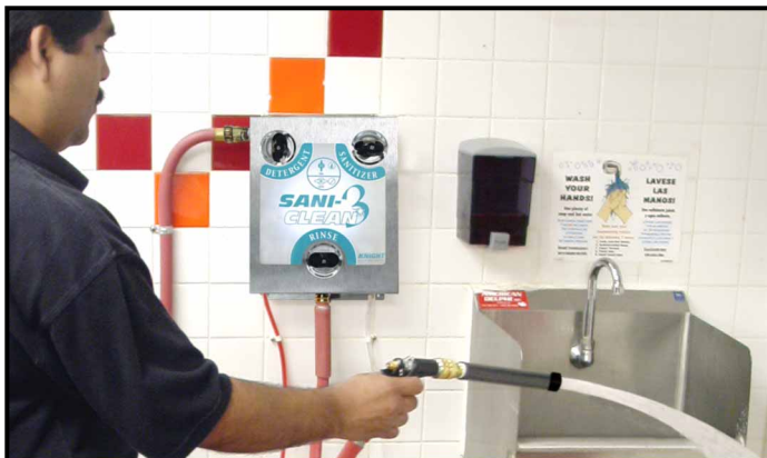
New foaming wand throws foam up to 5 feet. To operate, simply turn actuator valve, aim and pull spray gun trigger.